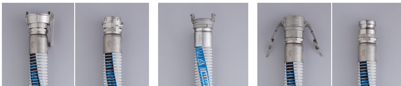
Tankwagen (Female &amp; Male)