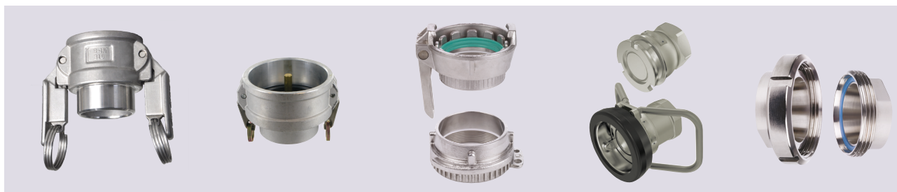
Autolock Cam &amp; Groove